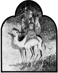
Magi from the east arrived

Two important themes are evident in today's Gospel account. One is wonder and the other is change is direction. Both are connected with the magi, the astrologers, the "wise men." Both are connected with our own journey, our own pilgrimage through life. Just as the magi went back to their home by another route after experiencing Jesus, so too do we, in our day, journey back home to heaven, now by a different route, a route unknown to the secular world. Now we know that life can no longer be lived as if God did not exist. We know that darkness and evil exist along this world's ways. We know that death awaits all who live in ways not directed toward our only true home, the home of our heavenly Father. Like the prodigal son's father, our heavenly Father watches and waits for us and runs to us as we make our way back. We know now, surrounded as we are by God's presence, that the path through life, the pattern of the life we are called to live, the route of our life's pilgrimage, has been eternally altered on this day of Epiphany.