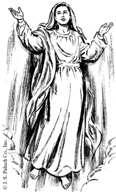
Assumption of the Blessed Virgin Mary