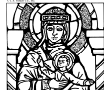
Blessed are You Among Women

In the Octave of Christmas , on the 1st of January , the church celebrates the Feast of Blessed Virgin Mary, the Mother of God. As we begin the New Year there can be no better way than in giving Honor and Remembrance to Mary and also asking the Lord for His strength and graces in the coming year of 2016 . It is my prayerful and heartfelt wish for the entire faith communities of St. Agnes and Holy Trinity — ever witnessing for our Lord by our presence.